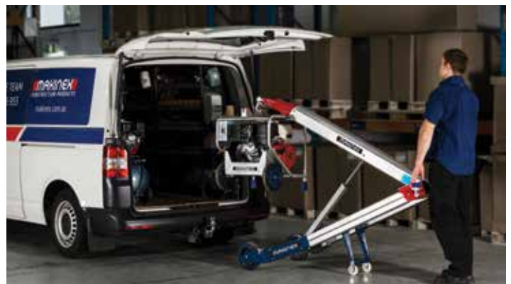
(below) Hook attachment comes standard and is used for lifting, moving and loading small equipment and machinery fitted with a lifting eye, e.g. water pumps, generators, air compressors, plate compactors.