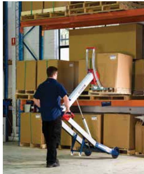
(left) Fork attachment comes with removable tilt head and fork lift arms, sold separately.