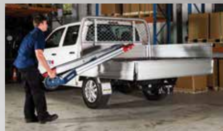
Folds flat for storage