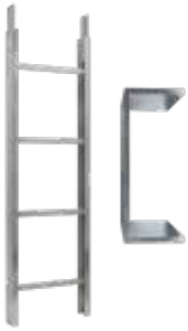
Ladder section 2 m 200 kg Art. No. 03378