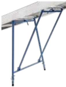
Prop for sheet carrier Art. No. 02812