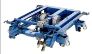
Tilting trolley Art. No. 02855