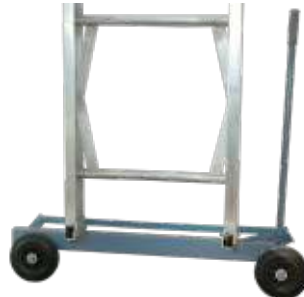
Wheeled undercarriage Art. No. 02822