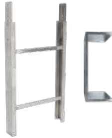
Ladder section 1 m 200 kg Art. No. 03379