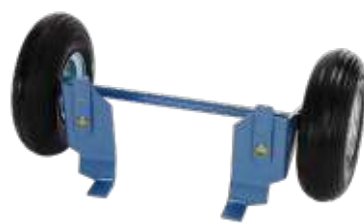
Transport axle Art. No. 02886