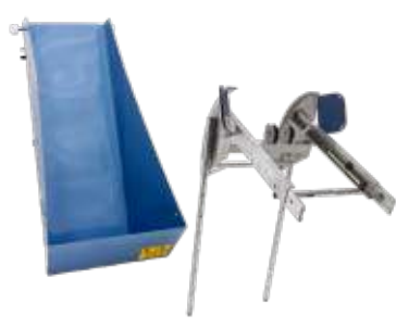
Tipping skip with tipping attachment Art. No. 02818