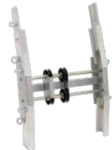
Angle track section Art. No. 02877