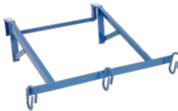
Bucket hanger Art. No. 02817