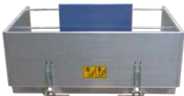
Rigid platform Art. No. 02253