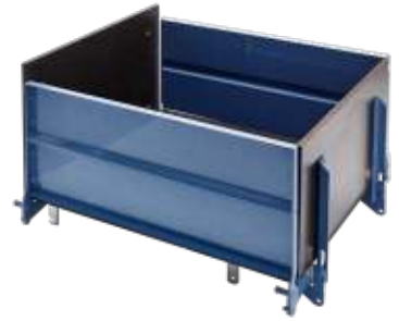
Vario platform Art. No. 02895