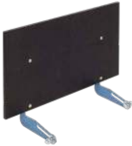
Front protector for general purpose platform Art. No. 02862