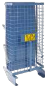
Tile holder Art. No. 02860