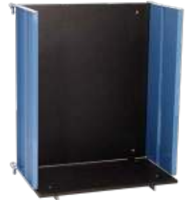
General purpose platform Art. No. 02893