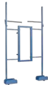
Sheet carrier Art. No. 02831