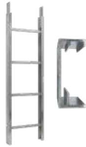
Ladder section 2 m 250 kg Art. No. 02888