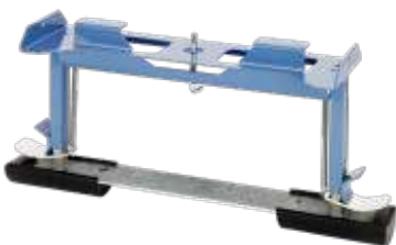
Roof tie Art. No. 02826