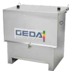
Liftbox Art. No. 46309

For further accessories visit: www.geda.de