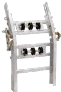
Angle track section Art. No. 02828