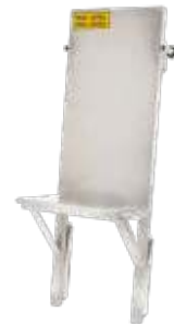
Roof tile batten trolley Art. No. 02884