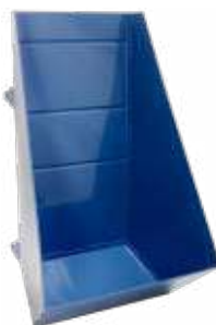
Tipping skip (for tilting trolley only) Art. No. 02856