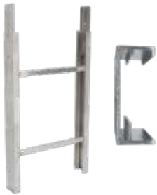
Ladder section 1 m 250 kg Art. No. 02889