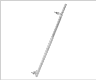
Swivel arm support Art. No. 29497