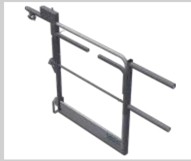
ECO S Art. No. 42500