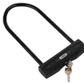
Padlock Art. No. 01429

For further accessories visit: www.geda.de