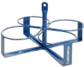
Bucket hanger for 4 buckets Art. No. 01811