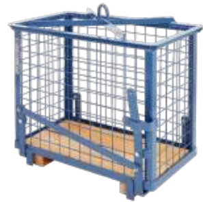
Brick cage Art. No. 01816