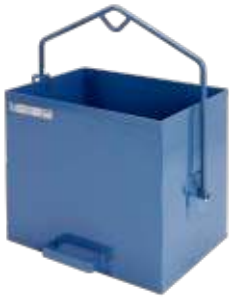
Tipping container 65 l Art. No. 01814