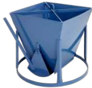
Mortar skip 65 l Art. No. 01815