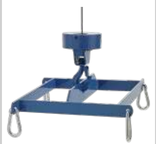
Bucket ring for 4 buckets Art. No. 01812