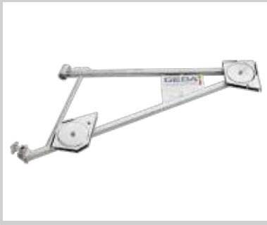
Swivel arm Art. No. 05711