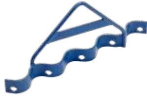
Hook tie for 5 hooks Art. No. 01827