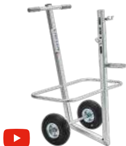
Transport trolley Art. No. 47760