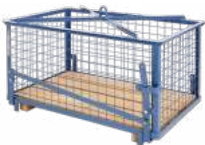
Delivery cage Art. No. 01820