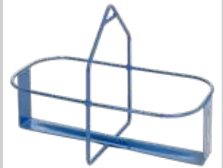
Bucket hanger for 2 buckets Art. No. 01810