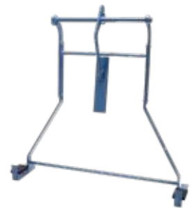
Board lifting frame Art. No. 01819