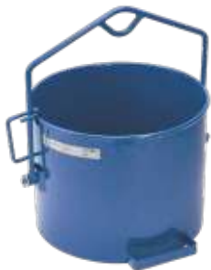
Tipping container 35 l Art. No. 01813