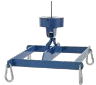
Bucket ring for 4 buckets Art. No. 01812