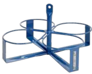
Bucket hanger for 4 buckets Art. No. 01811