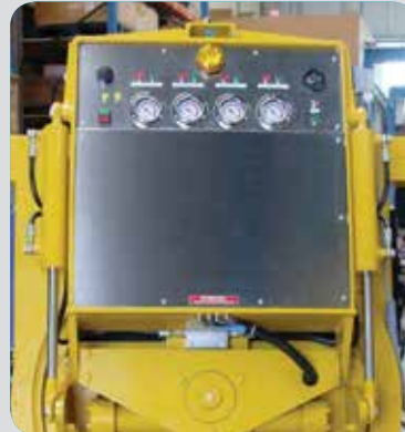
Control panel with quad-circuit vacuum and 90° twin hydraulic tilt cylinder system