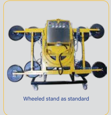
Wheeled stand as standard