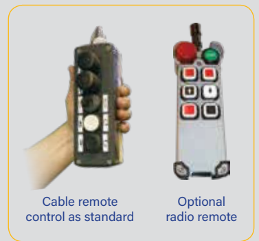
Cable remote control as standard