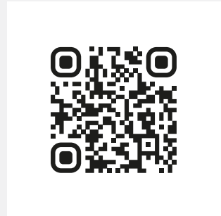
... plus 9 other attachments on first.green