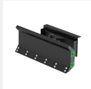
Small dozer blade